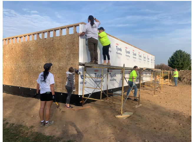
Volunteers from Little Rapids spent time helping at the Gresham house this fall.