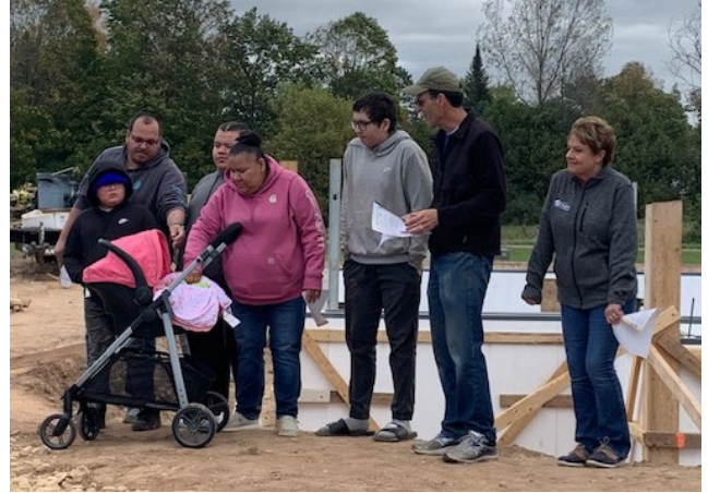
Habitat representatives, the partner family and volunteers gathered in Gresham for a groundbreaking ceremony in October.