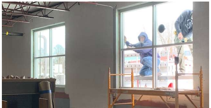
Volunteers helped install new windows at our store and warehouse.