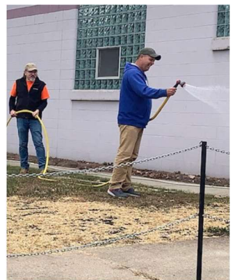
Special thanks to our Premier Bank and ThedaCare groups for volunteering their time and talents.