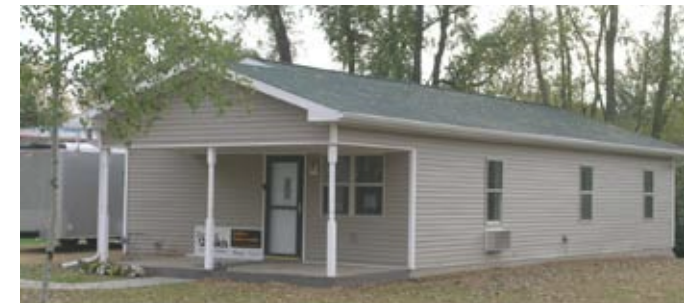
This Habitat and Thrivent Builds home was built in Shawano in 2007. We’ll soon be starting a new Thrivent Builds home in the Village of Tigerton.

• Is this the first time Thrivent Financial has worked with Habitat? No, but this agreement does significantly expand Thrivent Financial’s already strong relationship with Habitat for Humanity. Since 1991, Thrivent Financial and its members have worked with Habitat to build more than 500 homes, raise more than